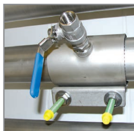
B Spot drilling collars