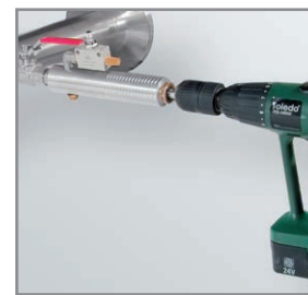
Drill under pressure with the CS drilling jig

3) Due to the large measuring range of the probe even extreme requirements to the consumption measurement (high volume flow in small pipe diameters) can be met.