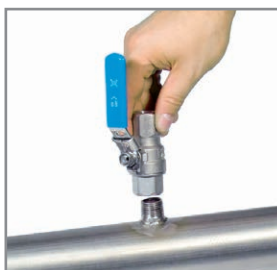
A Screw neck

By means of the drilling jig, it is possible to drill under pressure through the 1/2" ball valve into the existing pipe. The drilling chips are collected in a filter. Then install the probe as described under 1).